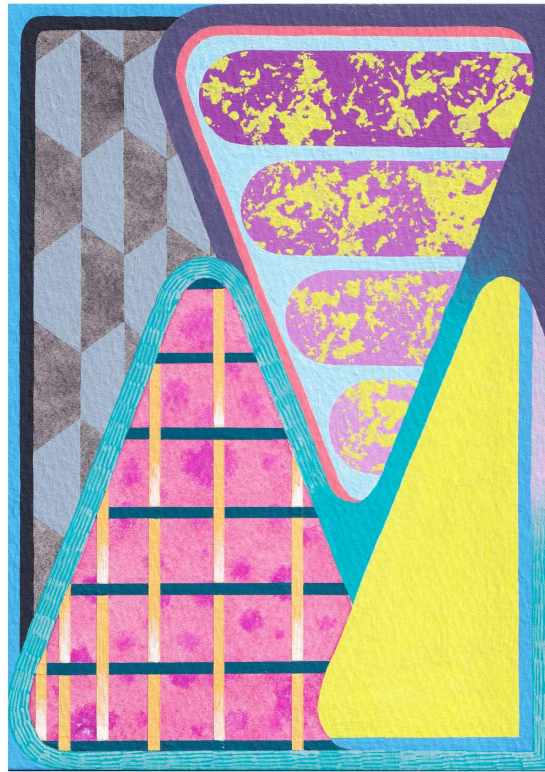
Mark Joshua Epstein, Your Last Hopes for Your Future Self , 2023, acrylic on watercolor paper, 7 x 5 inches

Closing reception Saturday, March 16, 3–5 PM