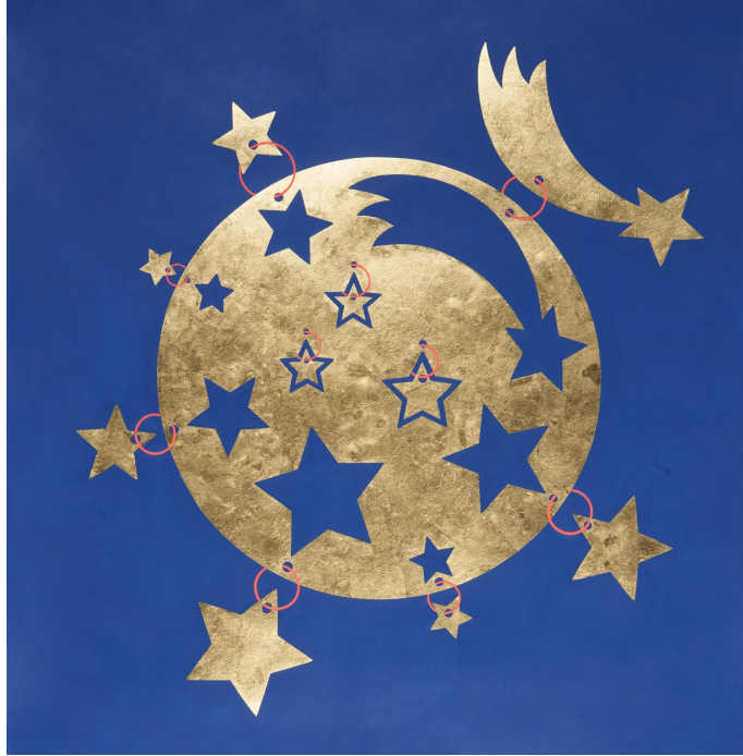
Amelia Toelke, Meteor Shower , 2021, 24K gold leaf, gouache, and latex paint on paper, 23 x 23 inches