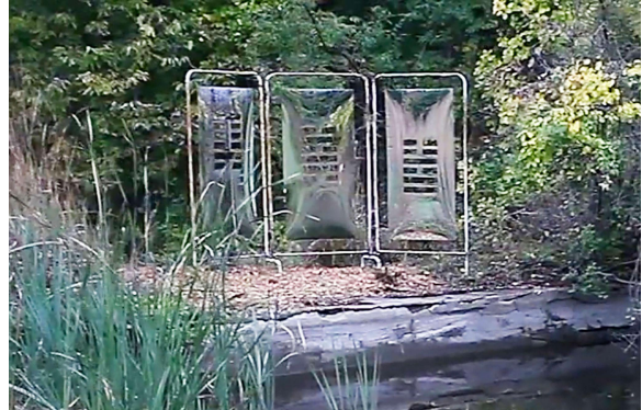
Francine Hunter McGivern, Yin/Yang as Reflection , 2015, hand-cut mirrored plexiglass panels, vintage hospital screen, 60 x 90 inches