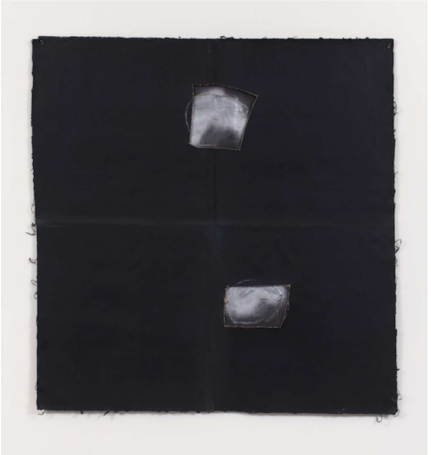
Mary Heilmann, "Gemini" (1971)