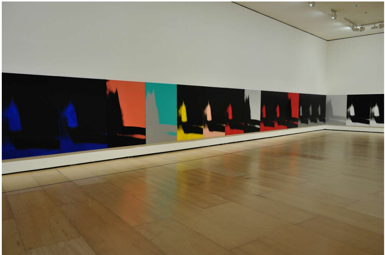
Andy Warhol, "Shadows," on display at the Guggenheim in Bilbao, Spain.

Opens Sept. 30, Friday-Monday, 10 a.m.-5 p.m.