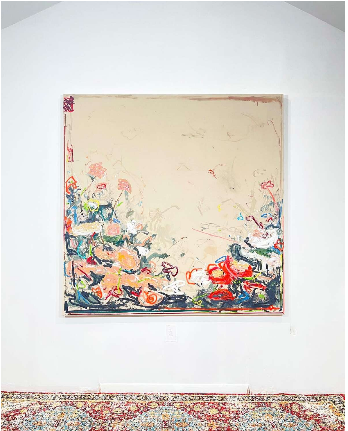
Huê Thi Hoffmaster's color field paintings are part of the group show "Thresholds of Abstraction" at BAM Art