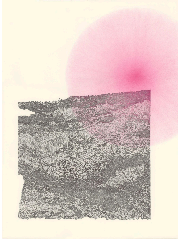
Joey Parlett, Reverse wave , 2023, ink and colored pencil on paper, 30 x 22 inches