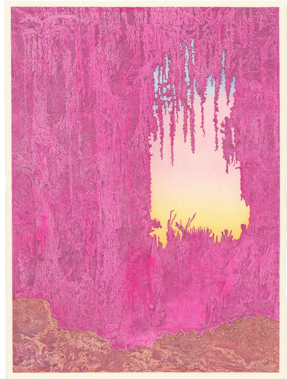
Joey Parlett, Swamp haze , 2023, ink, watercolor, and colored pencil on paper, 30 x 22 inches