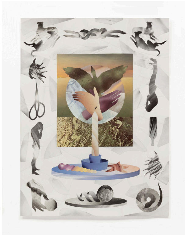
David Woodward, Shadows and Light , 2021, mixed media, 23 x 17.5 inches

Opening reception Saturday, April 6, 3–5 PM