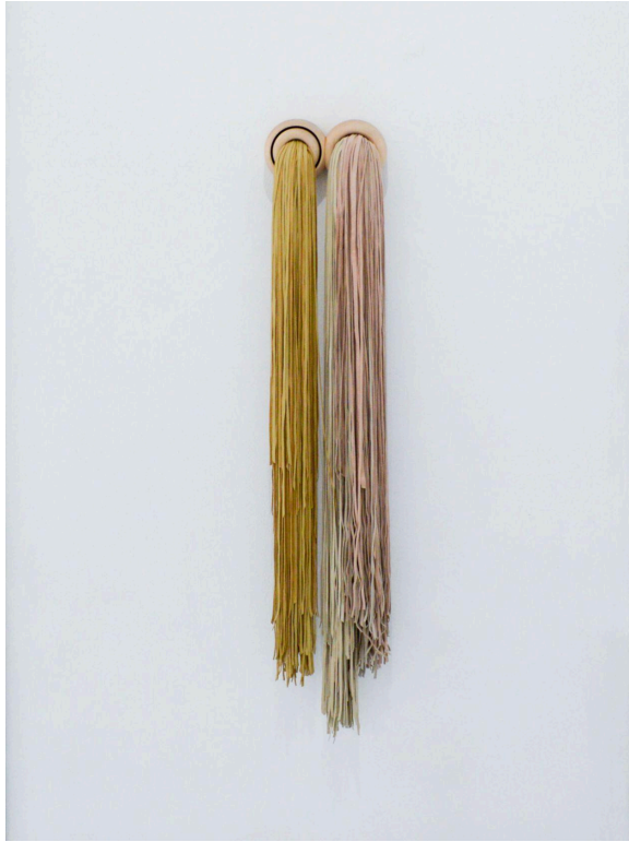
Montgomery Smith, cream , 2023, hand-cut leather and wood, 37 x 7 x 3.75 inches